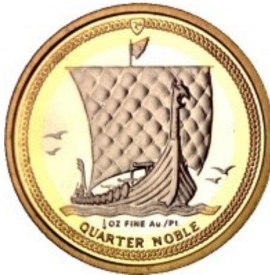
Larger than actual size. (Also, this is a picture of the Quarter Noble, not the Half Noble.) Below – the curious 3-legged racer on the Manx flag.

Seeing the Half Noble is like getting struck by lightning. First, it is jaw-droppingly beautiful . On one side, an image of Elizabeth II, and on the other the prow of an old Norse longship, a reminder of the Vikings' arrival on the Isle of Man, a tiny kingdom allied with (but not part of) Great Britain, 60 miles